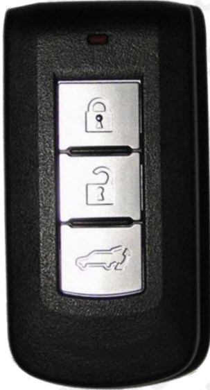
G8D-644M-KEY (434MHZ) F7952A Chip marking: F7952A