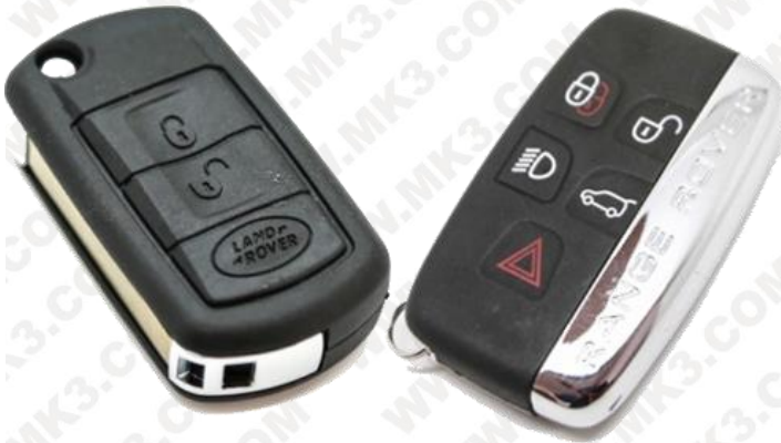
5E0U40247 (434MHZ) YWX000061 (434MHZ) Visteon YWX000071 (315MHZ) Visteon