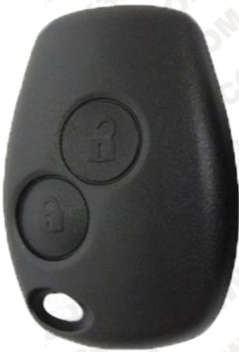
RENAULT, DACIA 805673071R (Remote Key 2Button), 433MHz,