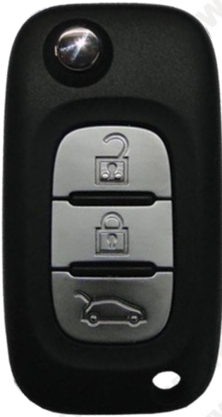
AK010008 Fluence 3Btn (433MHZ)